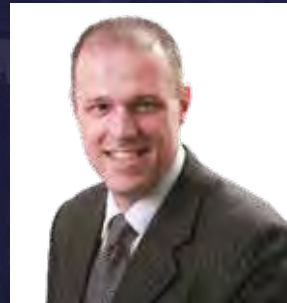
Chair, Projecting the Future Group